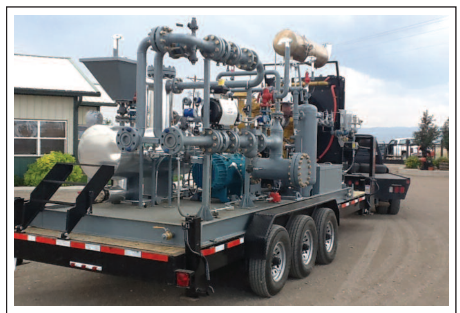
A portable blow-down unit can be towed to the well site by a standard 1.5-ton pickup. The pump is driven by a natural gas engine fueled by gas from the flowline. The unit is equipped with automation, controls and safeties to be completely self-supporting.

Normally, the liquids are drained to a surface blow-down tank or vessel. This requires gas either to be vented or flared to create the necessary gas flow velocity to move the liquids. The liquid volume