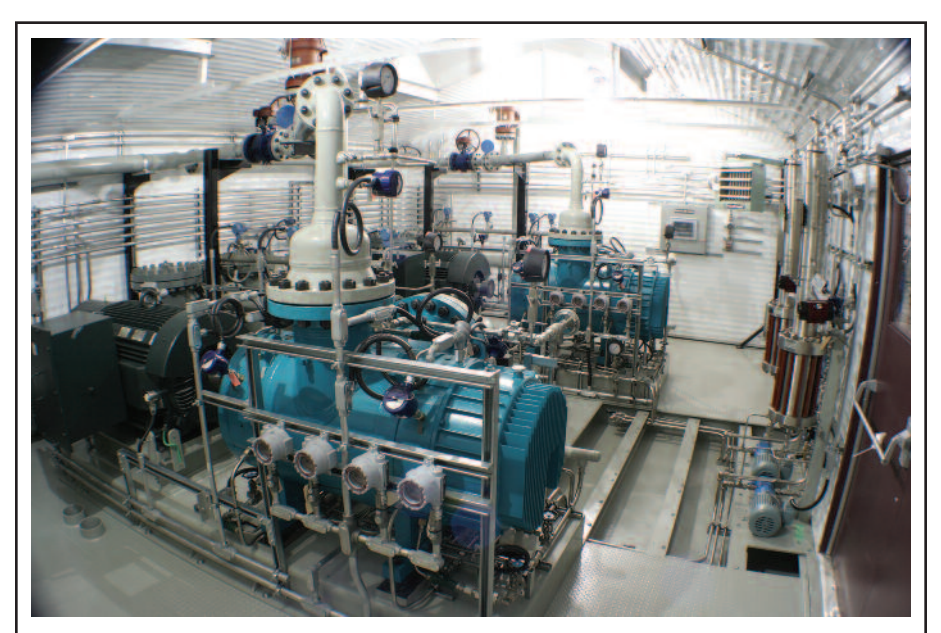
Two twin-screw pumps installed in parallel at a Canadian Bakken site operate as gathering pumps located close to a tank battery, and serve multiple satellites and wells. The gas void fraction for this installation is in the 80-90 percent range.

A simple test of rubbing the oil between one's fingers tells a story. Shale oil is very "dry" and the friction a person will feel between his fingers is much higher than with concentration oil. Consequently, the contacting pump design has had difficulties dealing with both the high amount of associated gas and the low lubricity of